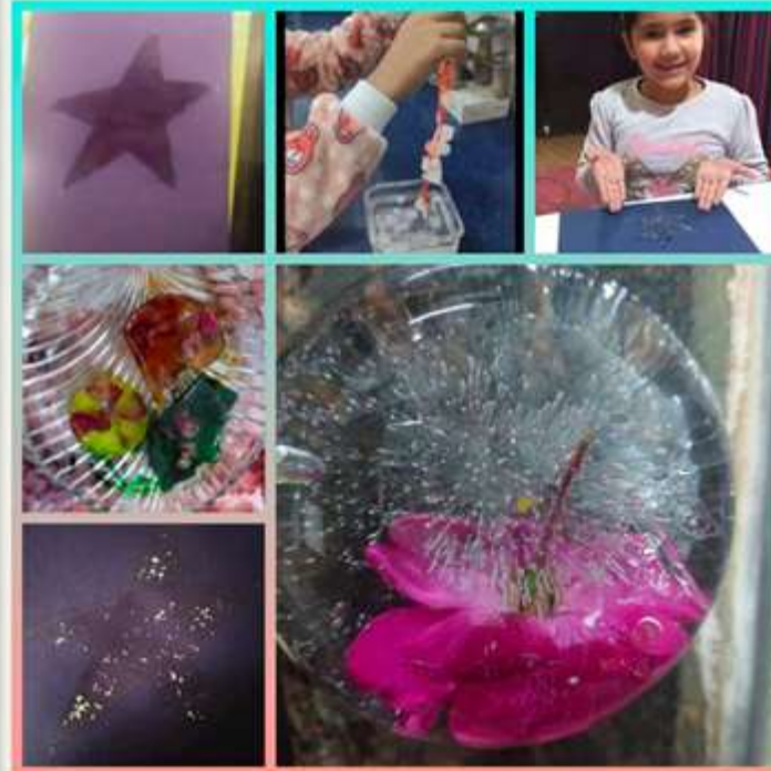
Class 1, 2 and 3